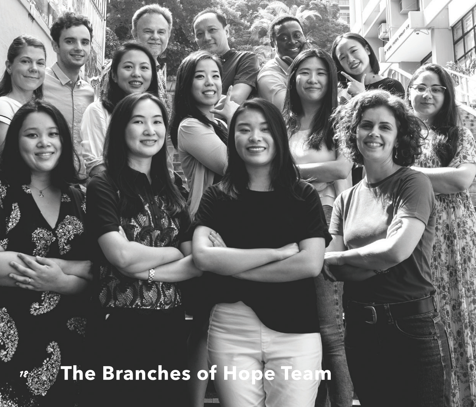
The Branches of Hope Team

All vulnerable and marginalised individuals and communities in Hong Kong will have equal access to resources and opportunities that allow them to realise their dreams and give them a voice in our society.